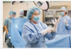
Healthcare & Surgical Suite