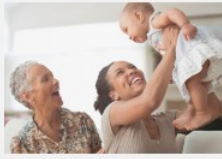
Baby, Adult and Feminine Care Absorbent Hygiene Components