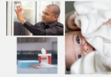
Disinfecting, Personal Care and Institutional Wipes